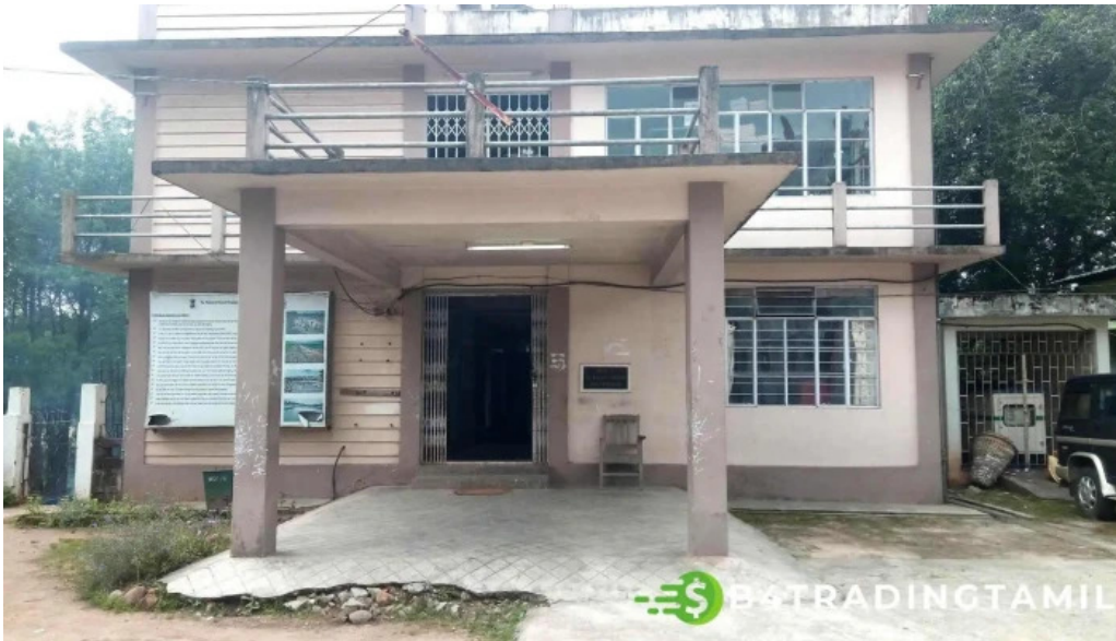
Ttistrikt ruurl ttevlpmennt eejennci ellaam