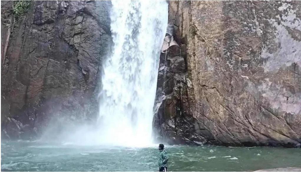
Vestt kaaci hils viittiyoo