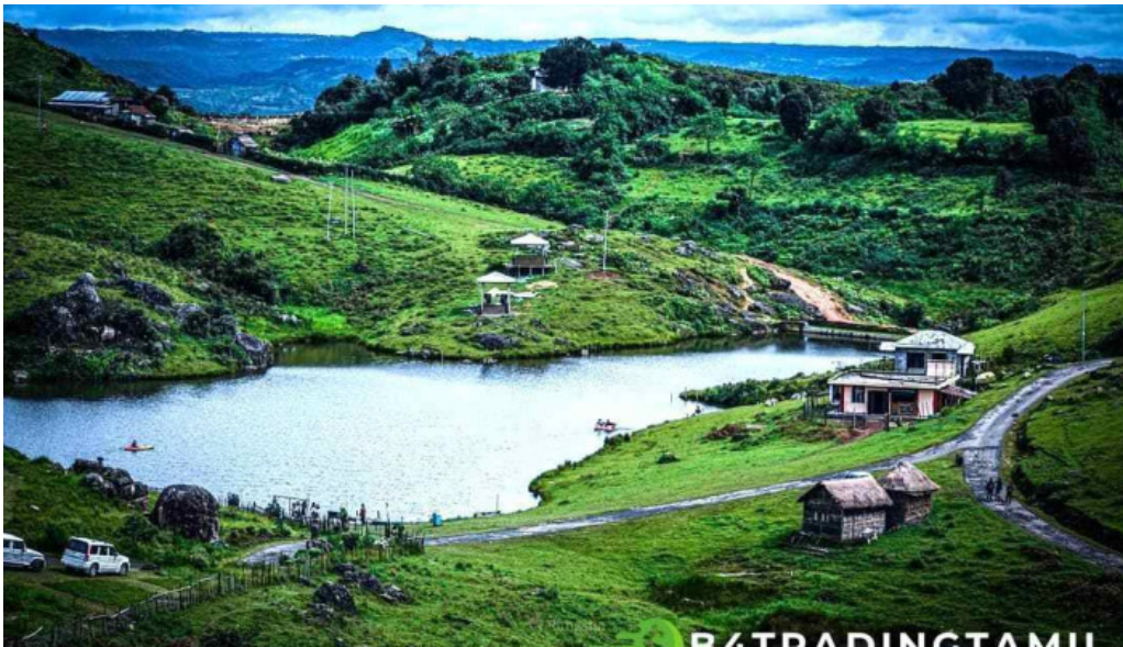
Vestt kaaci hils ellaam